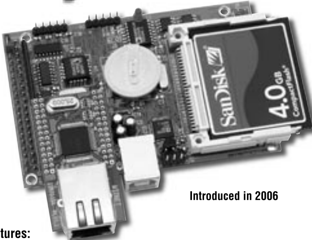
Introduced in 2006